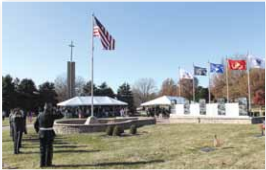
Veterans of Foreign Wars Post 7397 formed the color guard at the ceremony.