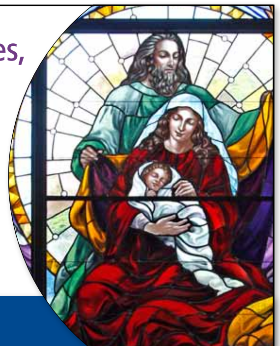
Photo of stained glass in Holy Family Mausoleum, Resurrection Cemetery, Lenexa, Kan.

We pray blessings on you and your loved ones and extend wishes for a joy-filled Christmas and a Happy New Year.