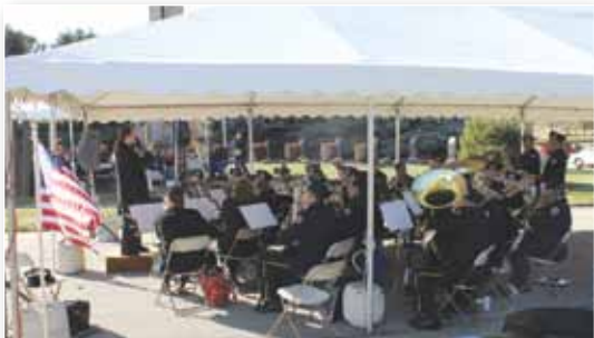
The American Legion Band provided a patriotic prelude and music during the program.