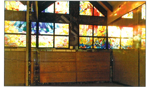
Wooden-shuttered couch crypts