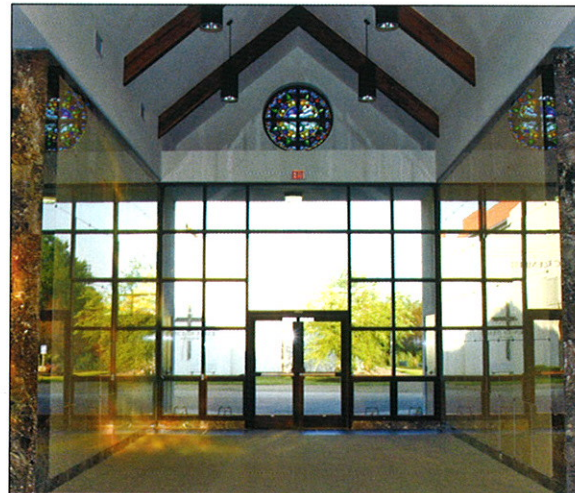
Holy Family Mausoleum main entrance